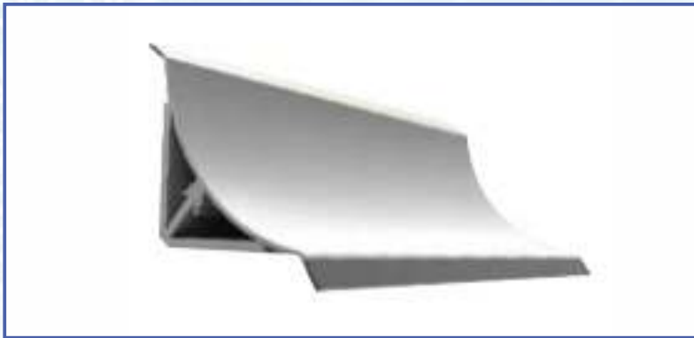
Hygienic Internal Profile