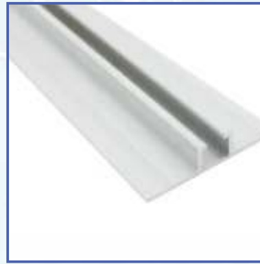
CEILING HANGER PROFILE