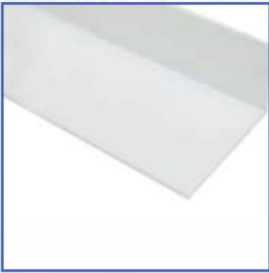
INTERIOR and EXTERIOR ACCESSORIES

Hygienic cold room accessories are the products that meet high customer needs in an economical way with the design that prioritizes quality and hygiene in cold rooms. They are the products that food companies should use in order to provide a more hygienic environment and fulfill HACCP requirements in product processing and storage areas. It provides a hygienic environment in the installation and installation of floor, wall and ceiling panels in cold rooms.